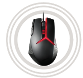
Lenovo™ Y Gaming Precision Mouse

18 macro commands, pass through ports and software support