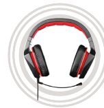
Lenovo™ Y Gaming Surround Sound Headset

7.1 surround sound built for lasting comfort