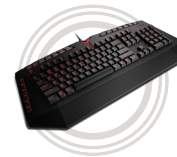
Lenovo™ Y Gaming Mechanical Keyboard

7.1 surround sound built for lasting comfort