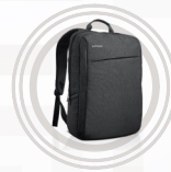
Lenovo Casual Backpack B200