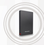
Lenovo UHD F309 1TB Portable Secure Hard Drive