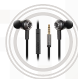
Lenovo 500 Extra Bass In-Ear Headphone