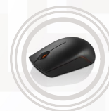
Lenovo 300 Wireless Compact Mouse