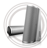
Lenovo 500 2.0 Bluetooth® Speaker