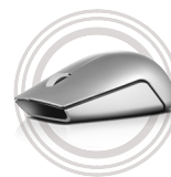
Lenovo 500 Wireless Mouse