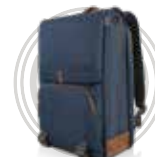
Lenovo 15.6" Laptop Urban Backpack B810