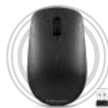
Lenovo 400 Wireless Mouse