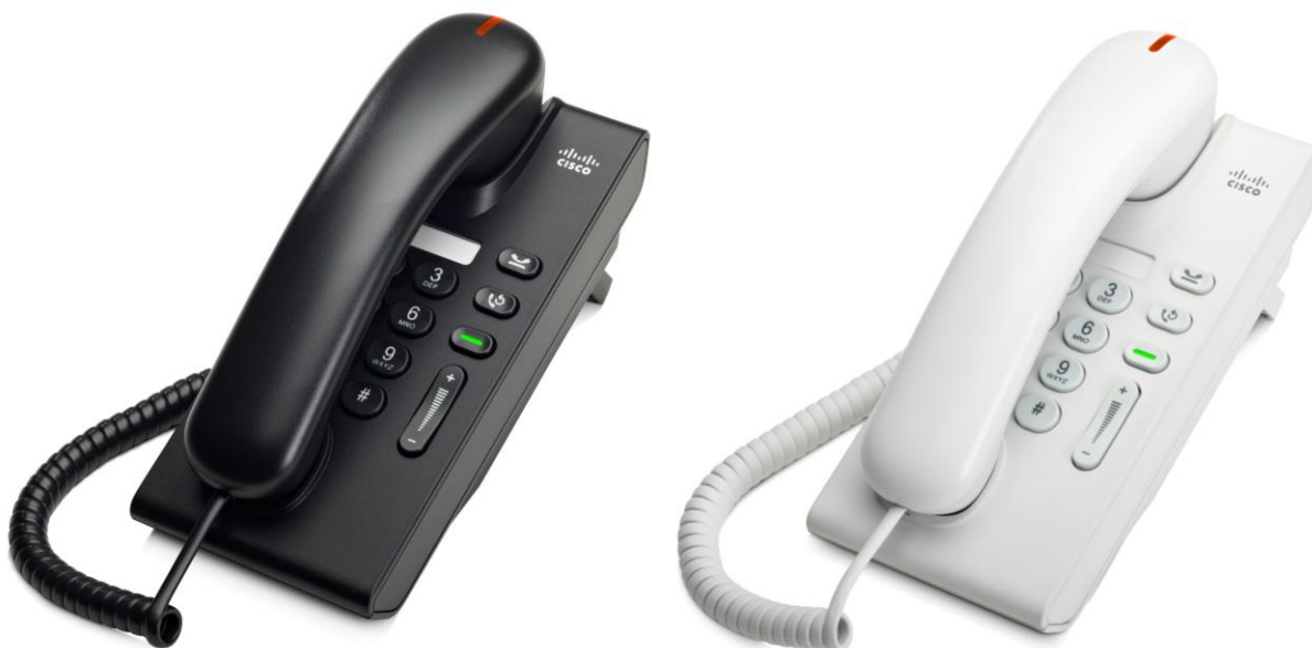
Figure 1. Cisco Unified IP Phone 6901

Cisco® Unified Communications Solutions enable collaboration so that organizations can quickly adapt to market changes while increasing productivity; improving competitive advantage through speed and innovation; and delivering a rich-media experience across any workspace, securely and with optimal quality.