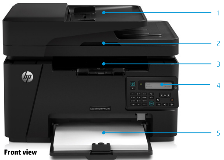
HP LaserJet Pro MFP M127fn shown