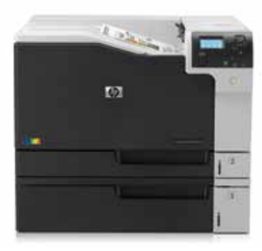
HP Color LaserJet Enterprise M750n

Mobile printing capability:10 HP ePrint, Apple AirPrint™