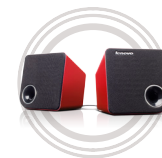
Lenovo™ M0620 2.0 USB Speaker