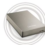
Lenovo UHD F309 USB 3.0 2 TB