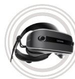
Lenovo Explorer Immersive Headset