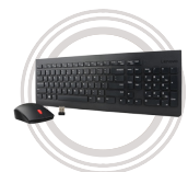
Lenovo 510 Wireless Combo Keyboard & Mouse

* Example of Lenovo IdeaCentre AIO catalogue naming convention