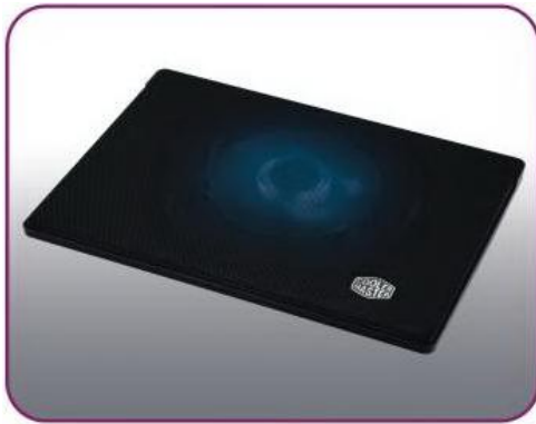
Slim and Lightweight