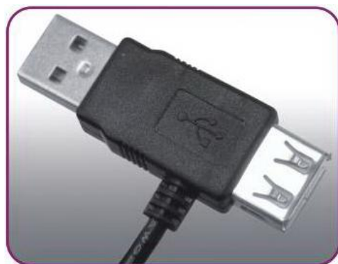
USB Port Extender

Note: Photos may differ slightly from the final product