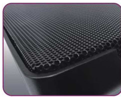
Full Range Mesh