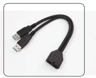
Adaptor for changing internal usb to external usb