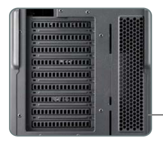
9 expansion slots for increased expandability