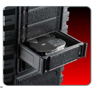
SATA Dock for easy installation without removing side panel