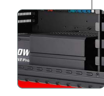
Power supply cable partition for neatness