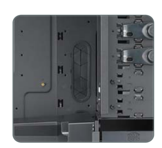
Cable grommets for better cable routing