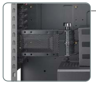
Advanced GPU holder for to reinforce heavy GPU cards