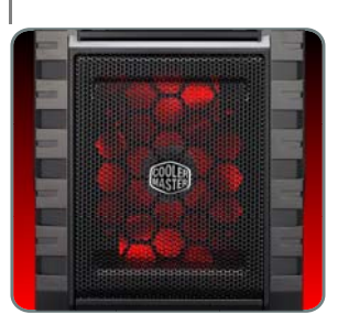
Front 230 mm red on/off LED fan provides excellent cooling to HDDs

Air duct designed to cool modern graphic cards