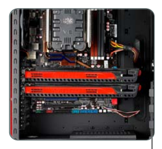
Supports long graphics cards including HD Radeon 5970