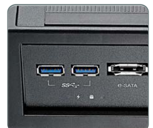
2 front USB 3.0 ports (Internal)