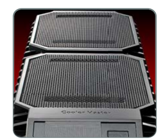
Up to 2 top 200mm fans (one optional) or 360mm radiator