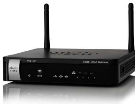
Figure 1. Cisco RV215W Wireless-N VPN Router

The Cisco® RV215W Wireless-N VPN Router provides simple, affordable, highly secure, business-class connectivity to the Internet from small and home offices and remote locations.