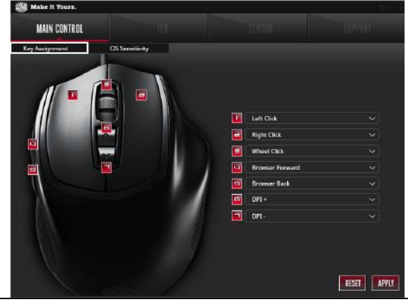
Controlling your Key Assignment